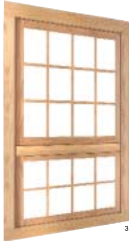
Attach interior wood muntin bars to window glass with clear 3M™ Dual Lock™ Low Profile Reclosable Fasteners.