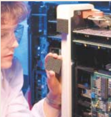
Pre-cut 3M™ Dual Lock™ Reclosable Fasteners hold access panels in electronic equipment. Pre-cut shapes are available with pressure sensitive adhesive or plain backing. Pop-in stems, slide-in pieces or mechanical attachments provide alternative options.

3M™ Reclosable Fasteners are available in rolls. All can be die-cut to fit your design and manufacturing process. 3M™ Dual Lock™ Reclosable Fasteners are also available in ready-to-use piece parts for application where limited surface area prohibits pressure sensitive attachment. Pre-drilled and pop-in stems help simplify fabrication.