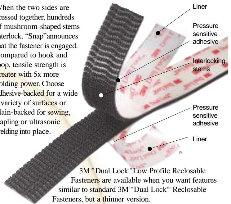
3M™ Dual Lock™ Low Profile Reclosable Fasteners are available when you want features similar to standard 3M™ Dual Lock™ Reclosable Fasteners, but a thinner version.

When the two sides are pressed together, hundreds of mushroom-shaped stems interlock. “Snap” announces that the fastener is engaged. Compared to hook and loop, tensile strength is greater with 5x more holding power. Choose adhesive-backed for a wide variety of surfaces or plain-backed for sewing, stapling or ultrasonic welding into place.