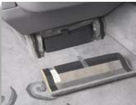
In and around the seat, 3M™ Flame Resistant Scotchmate™ Reclosable Hook and Loop Fasteners secure a kickplate/access panel, hold seat cushions in place, and fasten carpeting to the floor.

3M Reclosable Fasteners are hidden beneath the surface of your product. With adhesive-backed fasteners, there are no surface holes or protrusions.