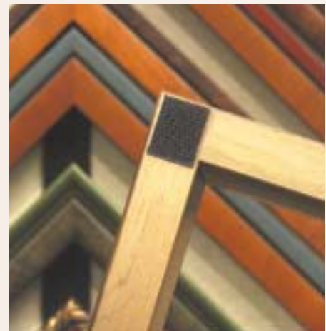
In retail custom framing, frame samples backed with die-cut 3M™ Scotchmate™ Reclosable Fasteners remove from the wall display and replace thousands of times for customer inspection and service.