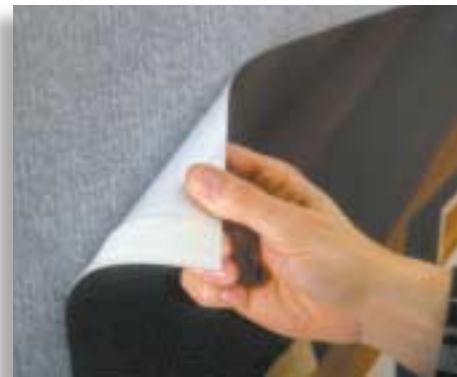
For a lightweight, portable exhibit, the hook side of a 3M™ Scotchmate™ Thin Reclosable Fastener is adhered to the back of a flexible graphic and meshes directly with the fabric backwall.

Adhesive-backed versions apply as quickly and easily as tape to many plastics, bare or painted metal, sealed wood, glass and more.