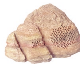
R6 in Sandstone

NEAR Rock Landscape Loudspeakers look like rocks, are shaped like rocks, and are even textured to feel like rocks. They are available in 8-ohm and 70V versions, in a 6" mid/bass driver in a horizontal orientation and an 8" mid/bass driver in a vertical orientation, and two color schemes: sandstone and granite.