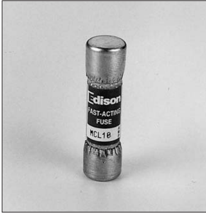
Catalog No. MCL (.1 - 50A) 600 Volts AC or Less Fast-Acting