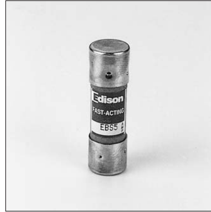
Catalog No. EBS (.2 - 10A) .2 - 5A 600 Volts AC or Less 6 - 10A 250 Volts AC or Less Fast-Acting