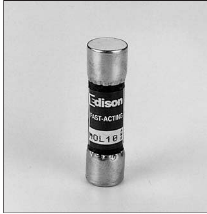
Catalog No. MOL (.5 - 30A) 250 Volts AC or Less Fast-Acting