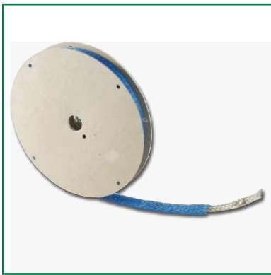
Bond Braid #6 with Eyelets and Web