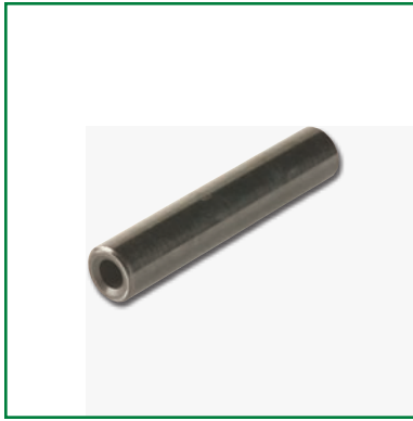
Ground Rod Drive Cup