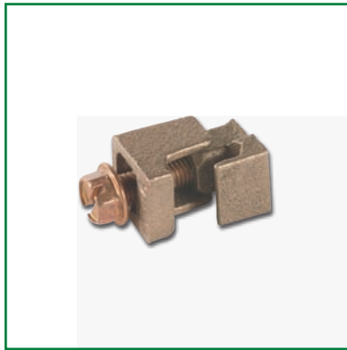
Bronze Vise Grip Connector