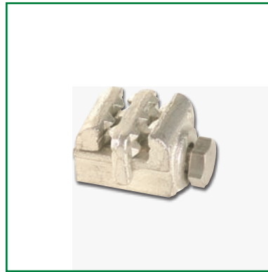
Tinned Bronze Vise Grip Connector