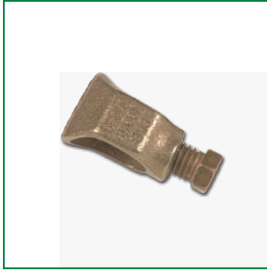
Heavy Duty Bronze Ground Rod Clamp