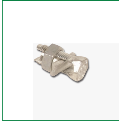
Tin Plated Split Bolt