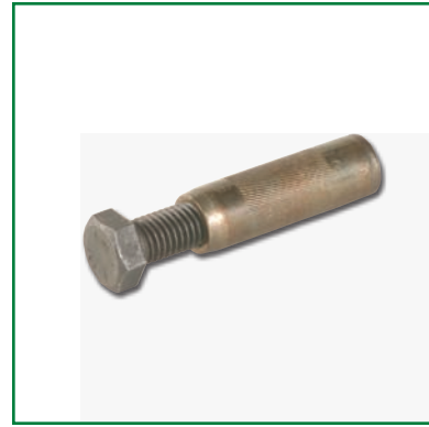
Ground Rod Coupling Threaded with Driving Stud