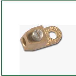
Bronze Lug Slotted Screw