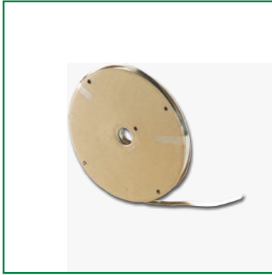
Bonding Ribbon Plain, 5 lb Spool