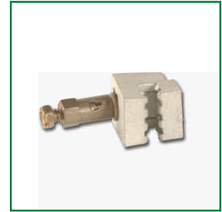
Trailer I-Beam Clamp