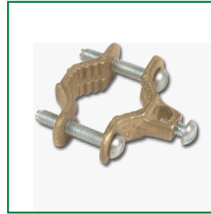
Bronze Ground Pipe Clamp