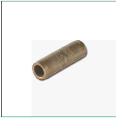
Ground Rod Coupling Threadless