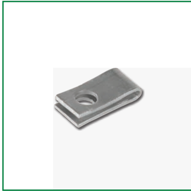
Bonding Ribbon Clamp