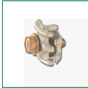
K1 Bonding Clamp