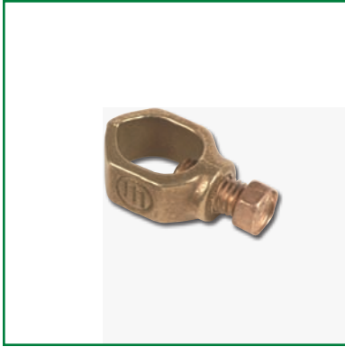
Bronze Ground Rod Clamp