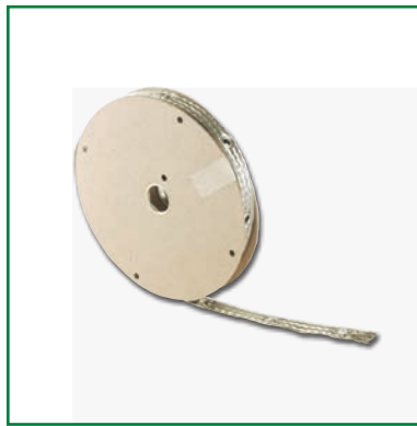
Bond Braid #6 with Eyelets