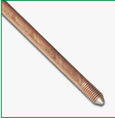
Sectional Threaded Rods