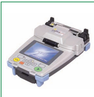
S122 Fiber Fusion Splicer