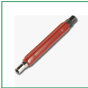
Terminal Can Wrench