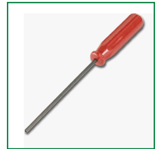
Booth Wrench Security Tool