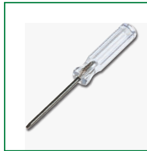
No. 3 Square Tipped Driver