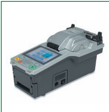
S177A Fiber Fusion Splicer