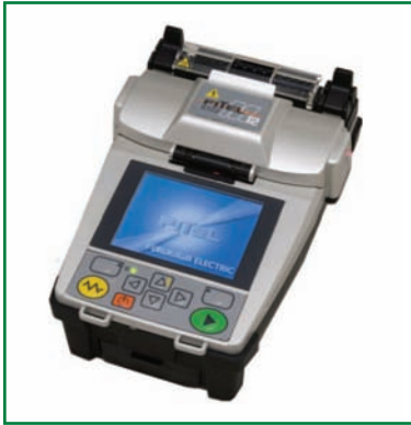
S122M12 Fiber Fusion Splicer