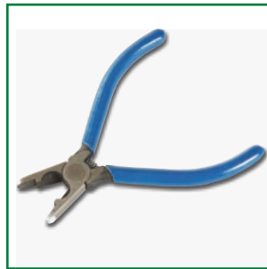
Discrete Connector Presser Plier