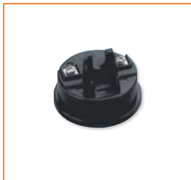
Plastic Transmitter Holder