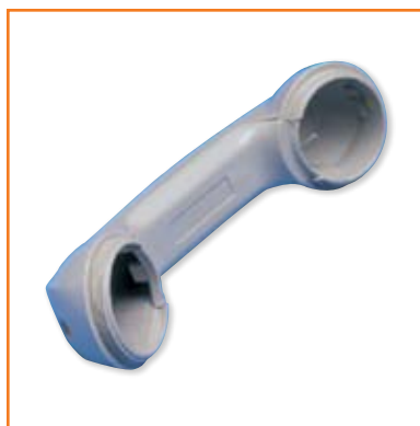
Plastic G-Style Hollow Handle, no Volume Control