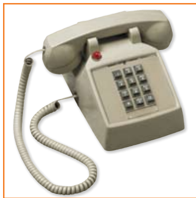
PREMIER Plus 2500 with Message Waiting in Ash, Fully Modular