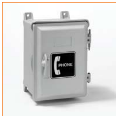
PT-9700 Weatherproof Enclosure