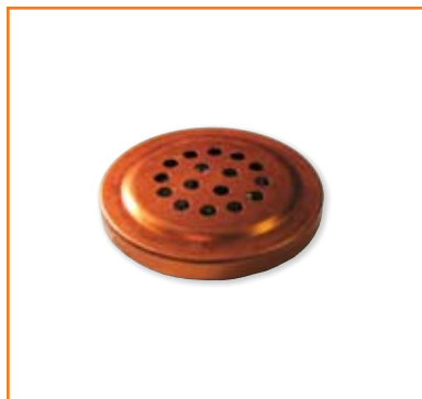
Electret Carbon Equivalent Transmitter for PREMIER 2500/2554 Phones