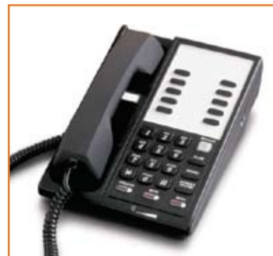
PREMIER 7150 Speakerphone in Black