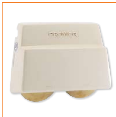
Bell Chime Ringer