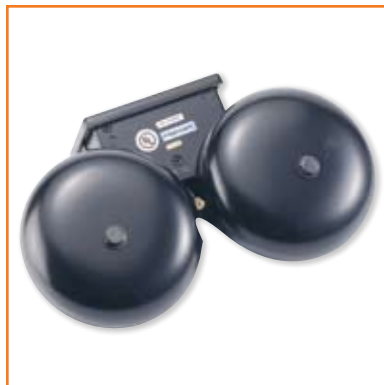
Loud Extension Bell