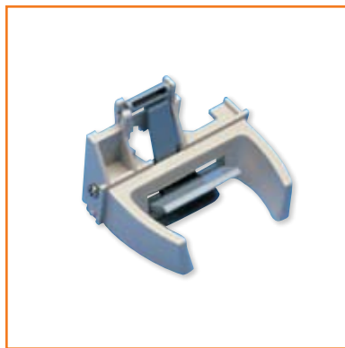
Plastic Cradle for 2554 Wall Phones