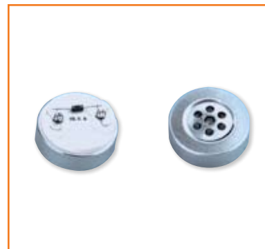
Hearing Aid Compatible Receiver