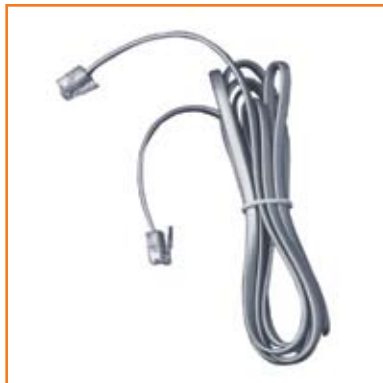
Plug-to-Plug Line Cords

Four, six, and eight conductor modular line cords for standard telephone sets.