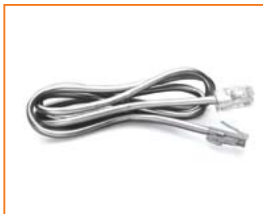
Plug-to-Plug RJ31X Cords