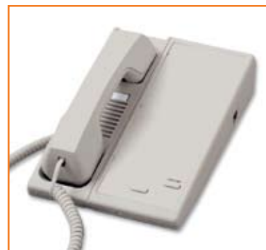
PREMIER 7040 Courtesy Lobby Phone