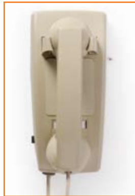
PREMIER 2554 Wall Courtesy Phone in Ash

PREMIER 2500 desk/2554 wall phones without dial