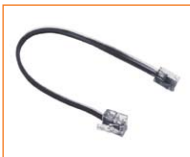
Modular Interface Cord