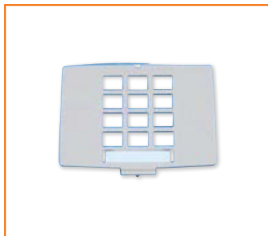
Plastic Faceplates for 2500 Desk Phones