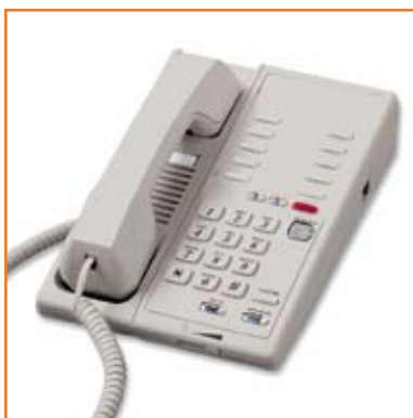
PREMIER 7270 Two Line Speakerphone with 10 Memory Button Phone in Natural Color