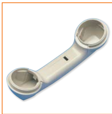
Plastic Hollow G-Style Volume Control Handle