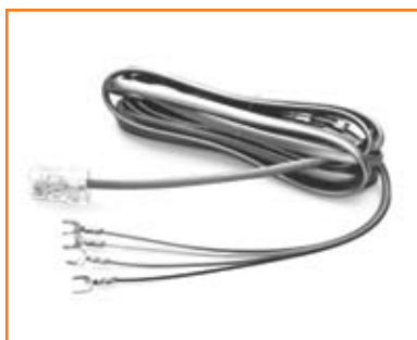
Plug-to-Spade RJ31X Cords