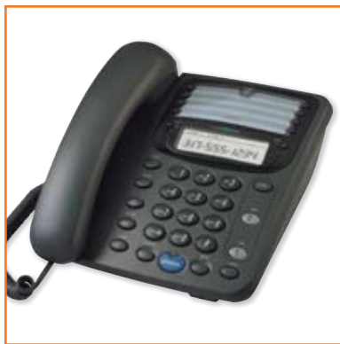
GE Thomson 2-Line Phone