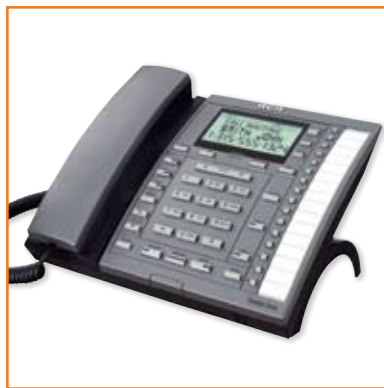
GE Thomson 2-Line CWCID Speakerphone