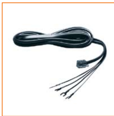
Plug-to-Spade Line Cords