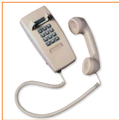
PREMIER 2554 Wall Phone