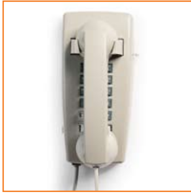
PREMIER Plus 2554 Wall Phone with 90 Volt Message Waiting and Flash