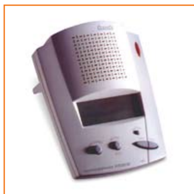
Classco VA9900CW Voice Announce Call Wait Caller ID Unit