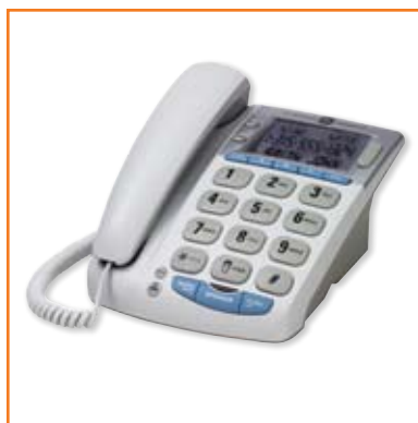
GE Thomson 29369