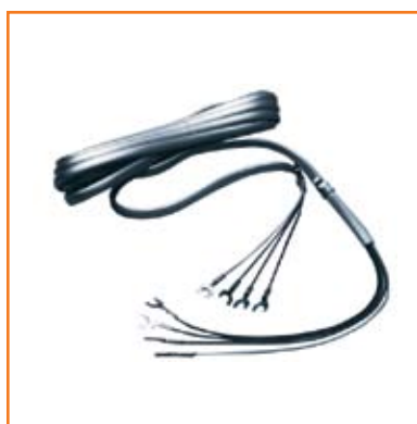
Spade-to-Spade Line Cords