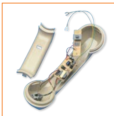
Plastic Hollow G-Style Handle and Receiver Volume Control Assembly for 2500/2554 Phones