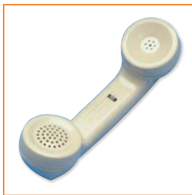
PREMIER Receiver Volume Control Handset Assembly