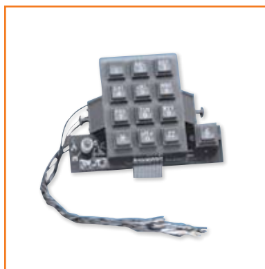
Touch Tone Dial for 2500 Desk Phone with Transfer Access (Flash) and Message Waiting

Industry standard DTMF generator, polarity guard, metro type white letters and numbers on gray button.