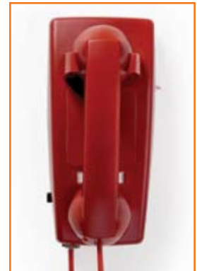
PREMIER 2554 Wall Courtesy Phone in Red