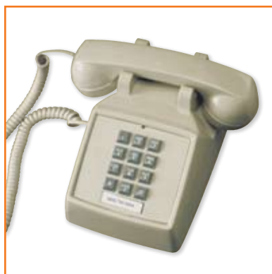
PREMIER 2500 Desk Phone