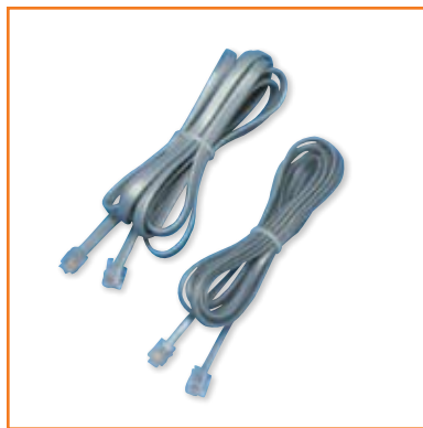
Replacement Plug-Plug Modular Line