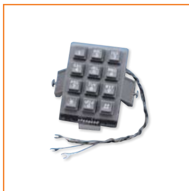
Standard Touch Tone Dial for 2500 Desk and 2554 Wall Phones