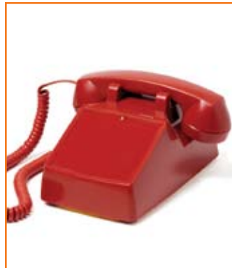
PREMIER 2500 Desk Courtesy Phone in Red

PREMIER 2500 desk/2554 wall phones without dial