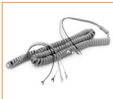
Spade-to-Spade Handset Cords