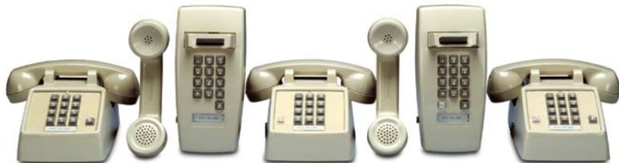
PREMIER Plus Telephones