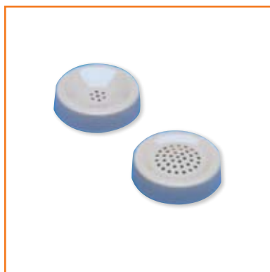
Plastic Receiver and Transmitter Caps for PREMIER G-Style Handles