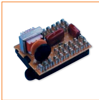
Standard Network with Spacer for 2500/2554 Phones