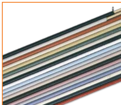
Plug-to-Plug Handset Cords