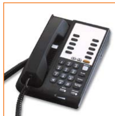
PREMIER 7270 Two Line Speaker with 10 Memory Buttons in Black