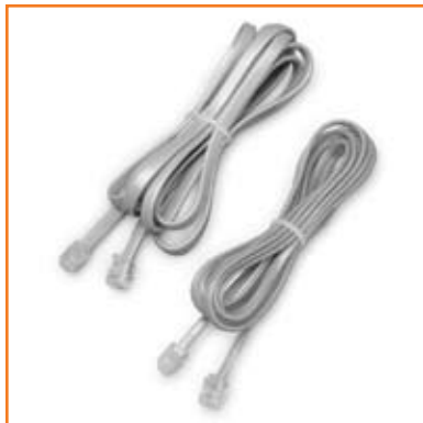
Plug-to-Plug Line Cords

Four, six, and eight conductor modular line cords for standard telephone sets.