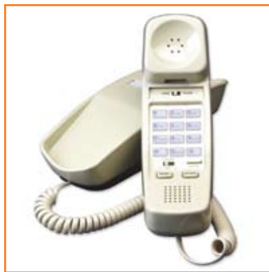
PREMIER Delight V Model 2910 Slimline