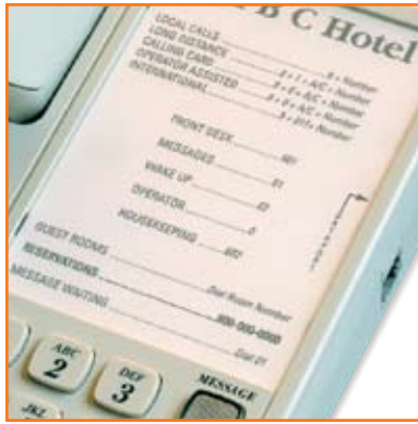
Make Custom Facemats with DESI Brand Facemat Software for PREMIER Series 7000 Phones and DESI Facemat Printer Paper