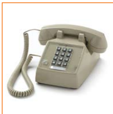
PREMIER Plus 2500 with 90 Volt Message Waiting in the Faceplate, Ash