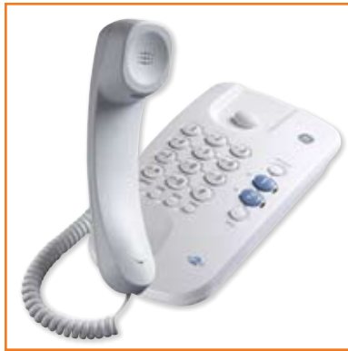
GE Thomson 2-Line Phone