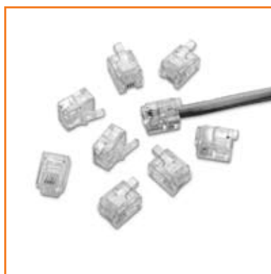
4C / 6C / 8C Modular Plugs

Line cord, handset cord, and data cord plugs are for terminating stranded cordage.