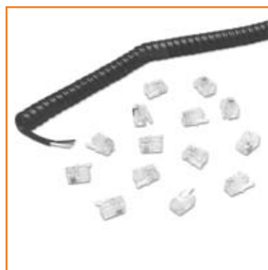
Modular Plugs for Handset Cords

Line cord, handset cord, and data cord plugs are for terminating stranded cordage.