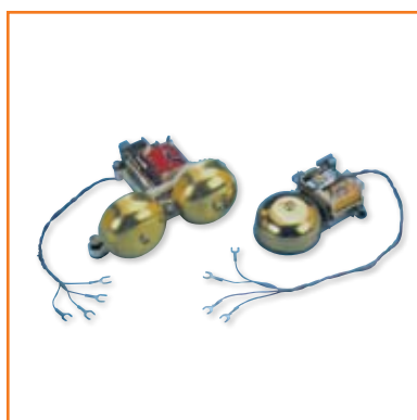
Double Gong Ringer for 2500 Desk Phones and Single Gong Ringer for 2554 Wall Phones