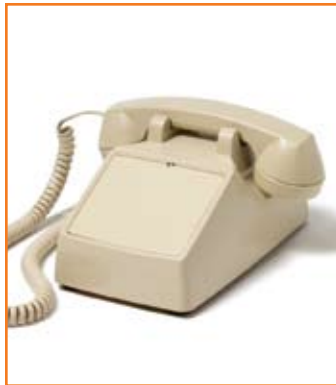
PREMIER 2500 Desk Courtesy Phone in Ash