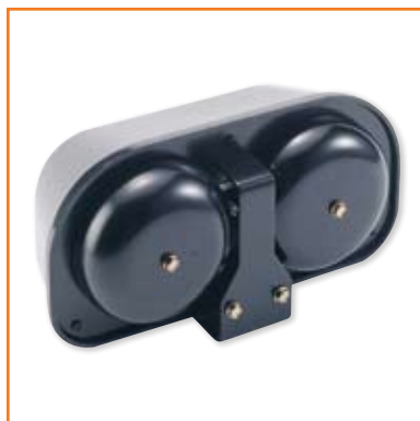
Loud Ringing Bell