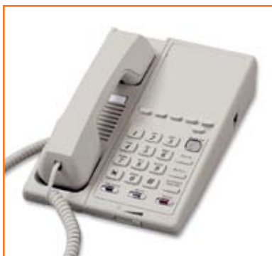
PREMIER 7155H Speakerphone with 5 Horizontal Memory Buttons