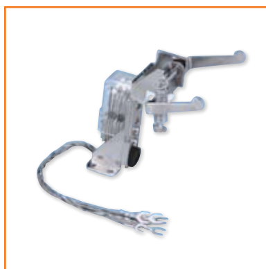
PREMIER Hookswitch Assembly for 2500 Desk Phone