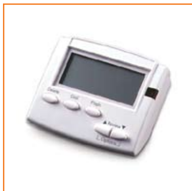
Questra 5050 Call Wait Caller ID Adjunct