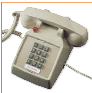
PREMIER Plus 2500 Desk Phone with Message Waiting Light and Data Jack