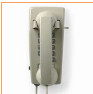
PREMIER Plus Wall Phone with Flash in Ash